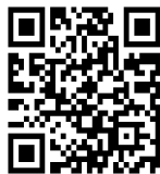
St. John's Facebook