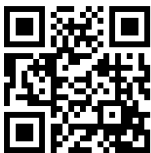
St. John's Webpage