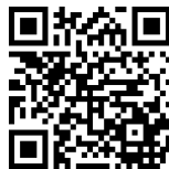
St. John's Compassion